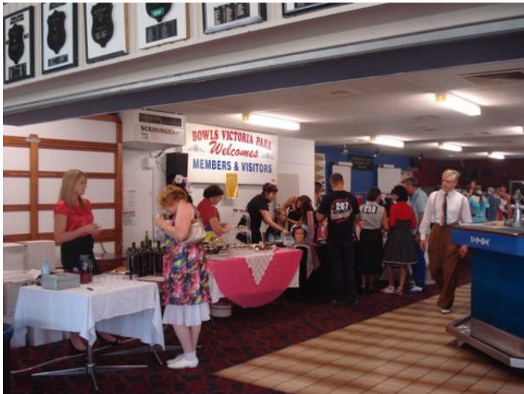
Lots of great merchandise and activities on offer!