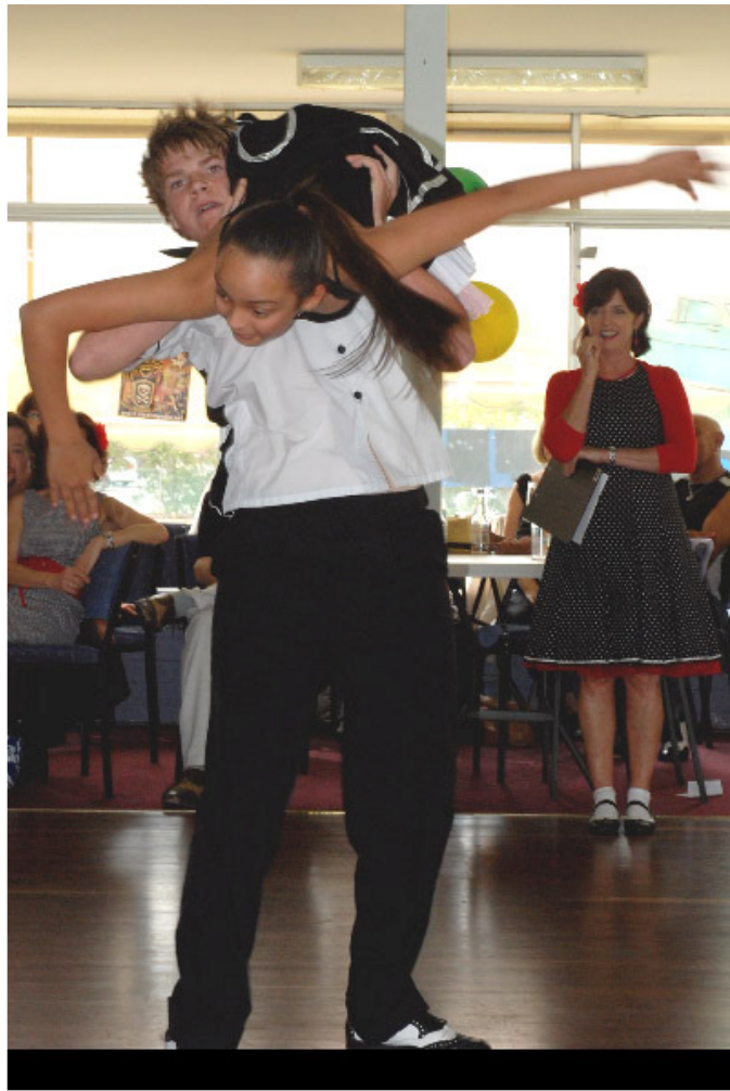
It's great to see a smile during a lift 😊